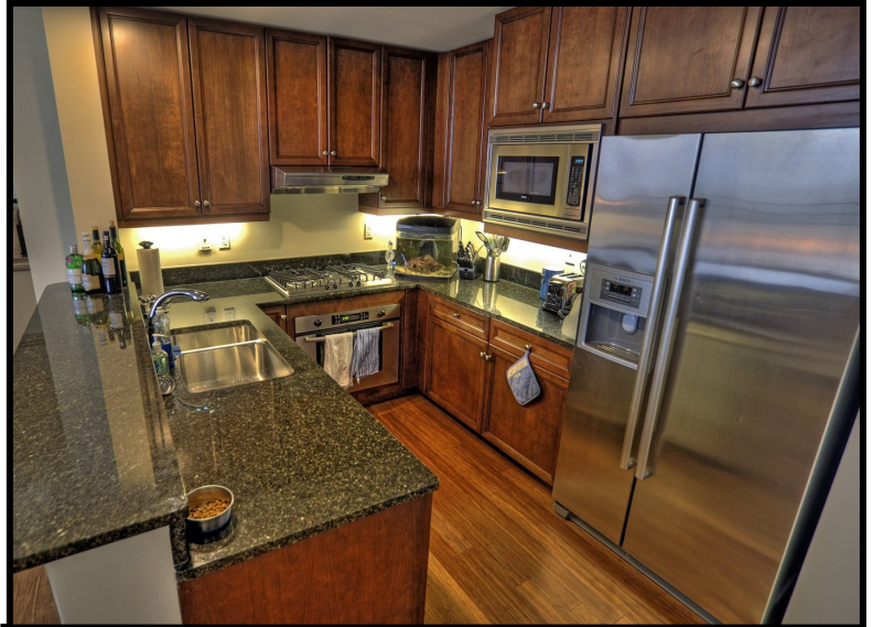
Actual pictures taken from an A3 residence