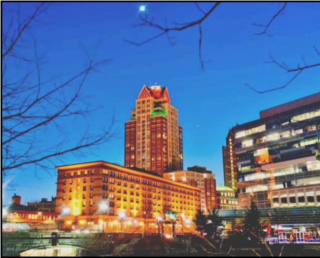
The Residences Tower light in Red and Green for the Holiday Season