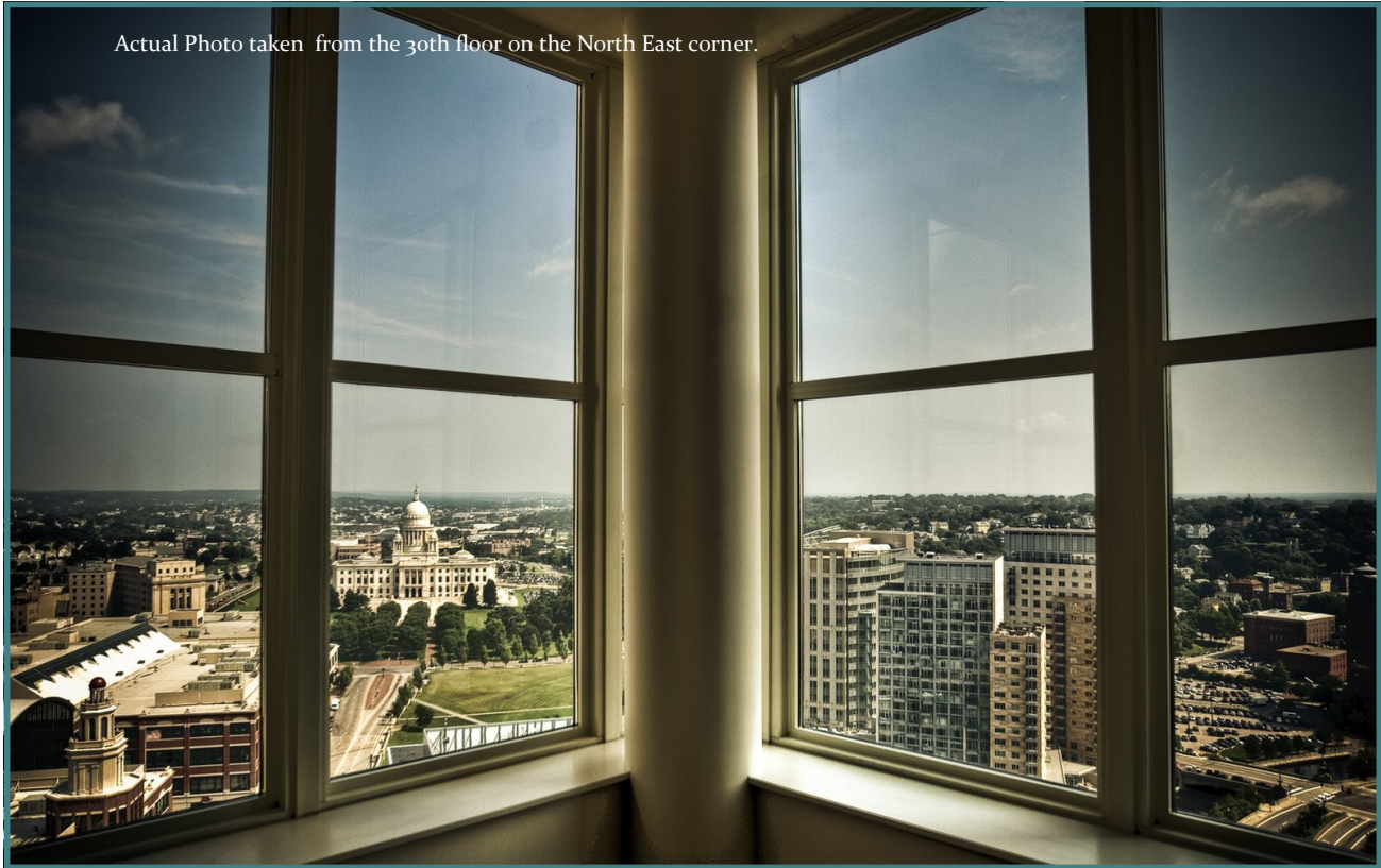
Actual Photo taken from the 30th floor on the North East corner.