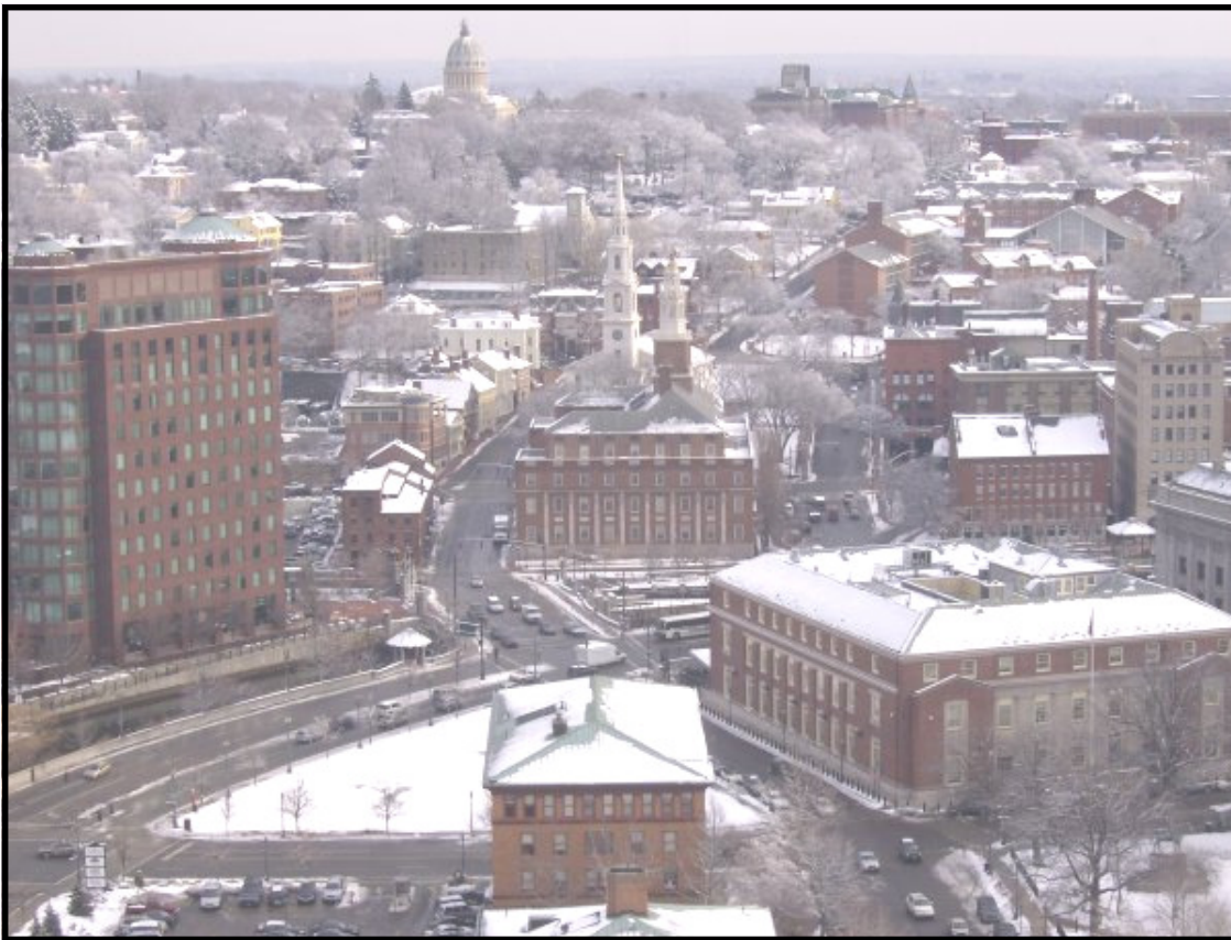
A photo taken by a Resident from 25th floor