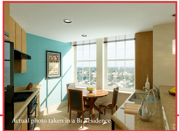
Actual photo taken in a B1 Residence